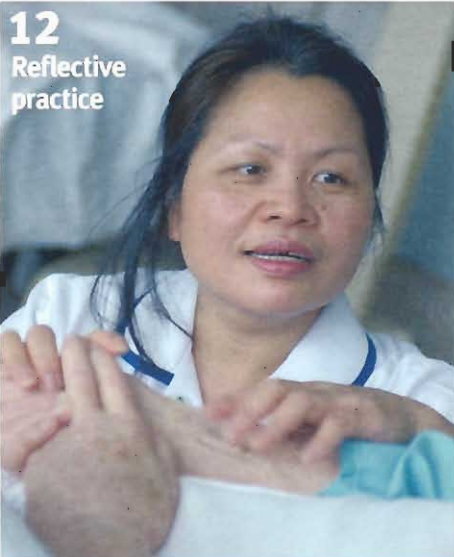
12 Reflective practice