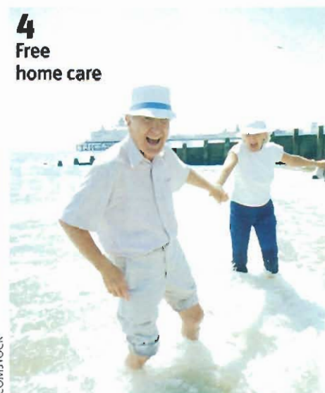
4 Free home care