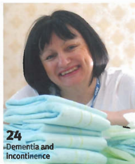
24 Dementia and incontinence