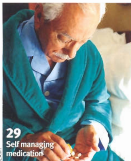
29 Self managing medication