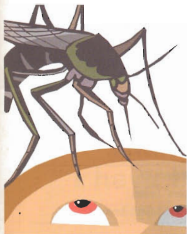
West Nile virus screening test, page 34