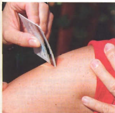
Removing an insect stinger, page 58