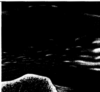
Managing pressure ulcers, page 36

Here's what you need to know to safely administer eight recently approved drugs.