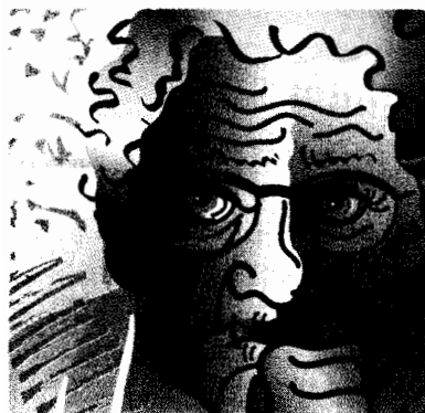
When acute adrenal crisis strikes, page 80