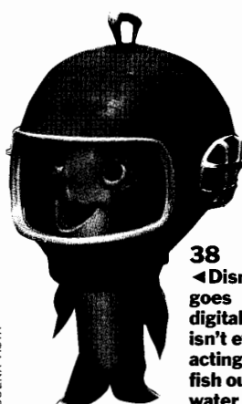
38 Disney goes digital—and isn't even acting like a fish out of water