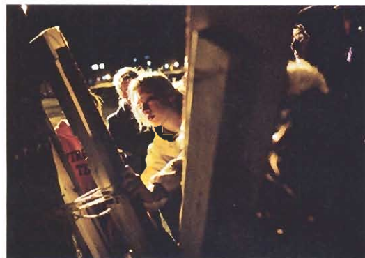
Rage and its aftermath Between slayings, Cho Seung-Hui sent images to NBC; later, mourners gathered, page 20