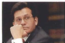
Trial by fire Alberto Gonzales, page 10