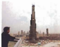
Towering ambition Burj Dubai, page 4