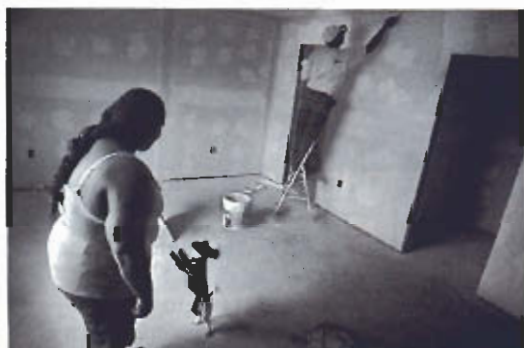
Storm warning New Orleans may still be in danger, page 18

PAGE | 4 | 9 | 17 | 18 | 37 | 41 | 45 | 54