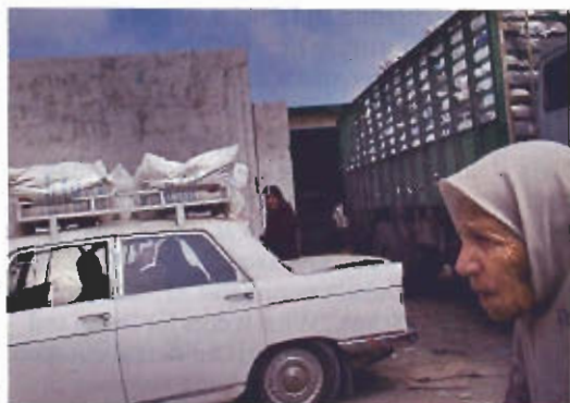
Mean streets Gaza suffers in isolation, page 30