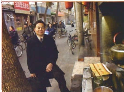
THE WIRE COLLECTION

TIME presents a collection of the most compelling images of 2006—photographs that capture the essence of the year's most memorable events, from the devastation of Beirut to a volcanic eruption in Indonesia to a head-butt by Zinedine Zidane that no soccer fan will ever forget. Feast your eyes and cast your mind back to a remarkable year