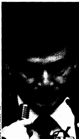
30 ▲ The story behind Dr. Hwang's disgrace