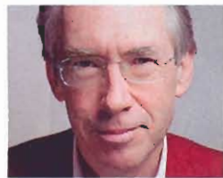
Ian McEwan The dark novelist in a new light, page 20