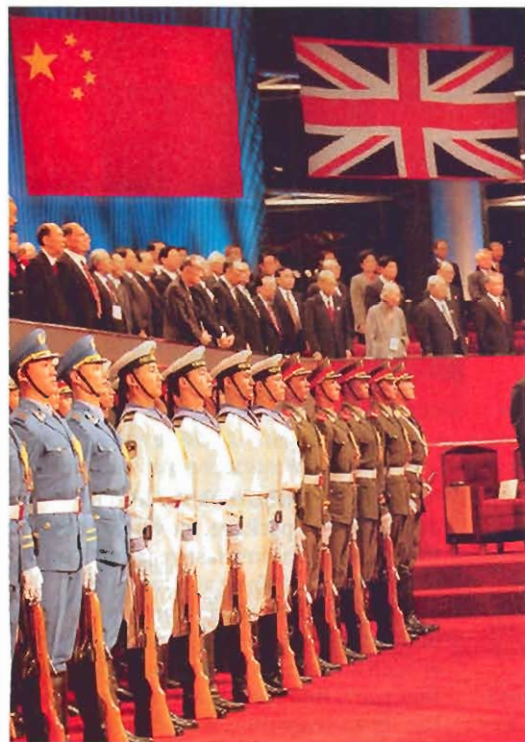
Red dawn Hong Kong and China reunited, page 32

PAGE | 4 | 9 | 21 | 22 | 32 | 57 | 63 | 70