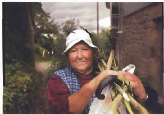
Vilar, Spain Where the cuisine is timeless, page 50

PAGE | 4 | 9 | 17 | 18 | 30 | 81 | 85 | 89 | 98