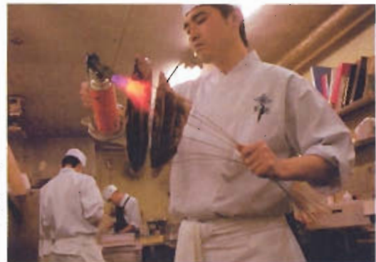
Kaiseki Japan's highest form of culinary art, page 60

On the cover: Photograph for TIME by Colin Campbell. Digitally altered