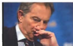
Tony Blair A parting shot at the pressing press, page 12