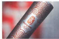
Olympic marathon The torch on tour, page 11