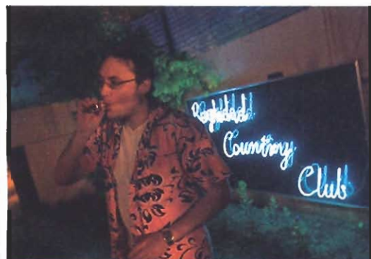
Fortress America Inside Baghdad's Green Zone, page 18

PAGE | 4 | 9 | 16 | 29 | 51 | 55 | 59 | 72