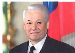
A leader's flawed legacy Boris Yeltsin, page 15

9 | THE MOMENT A hearing room in Washington becomes the new battleground for truth in Iraq