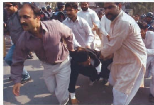
Martial law Anti-Musharraf protesters arrested, page 18