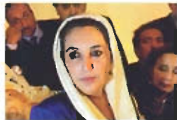
Benazir Bhutto Pakistan awaits her return, page 15