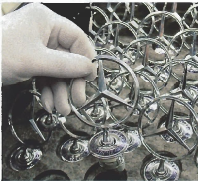
37 ▲ Mercedes-Benz is trying to restore some lost luster to its three-pronged star