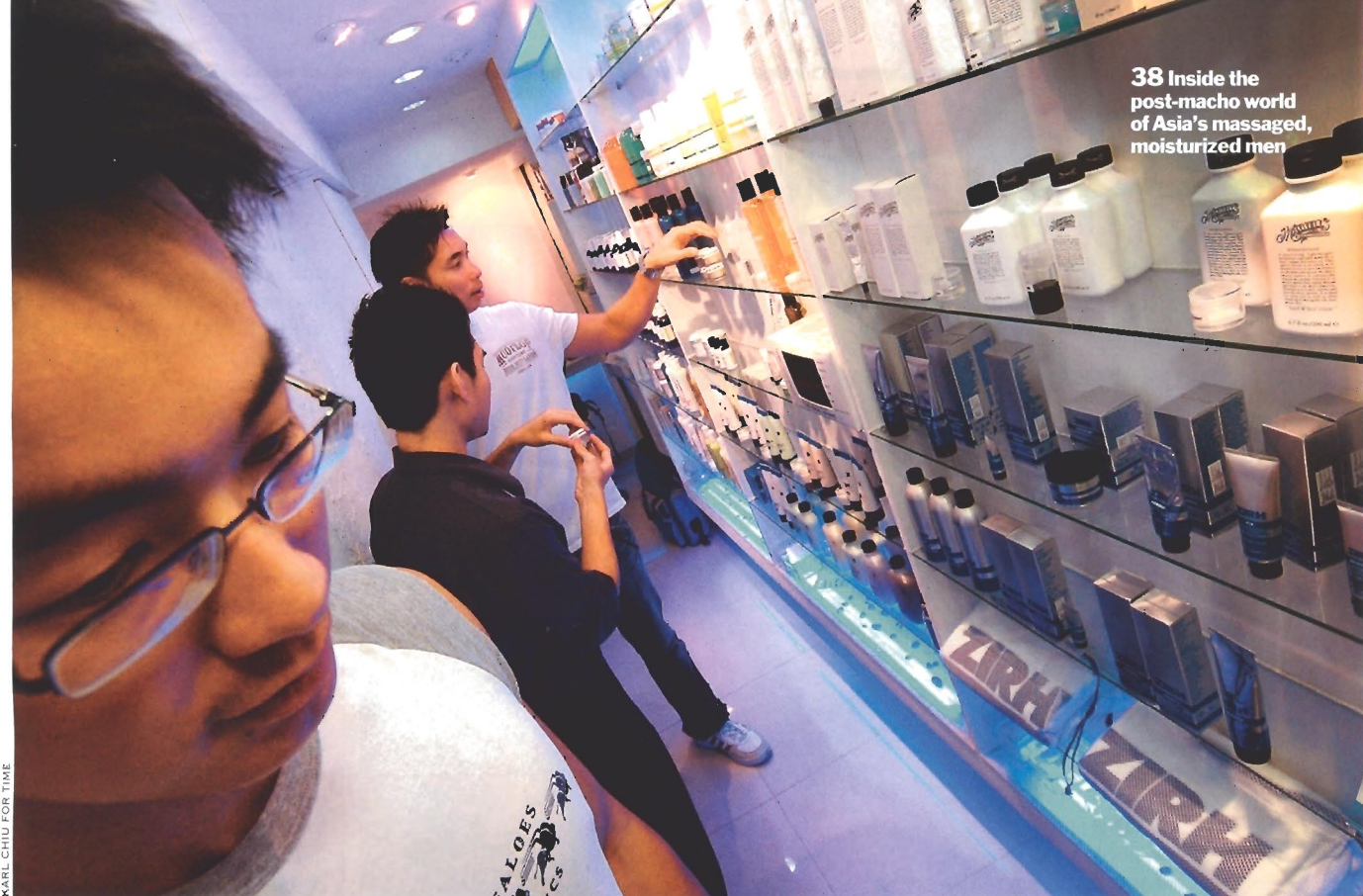
38 Inside the post-macho world of Asia's massaged, moisturized men