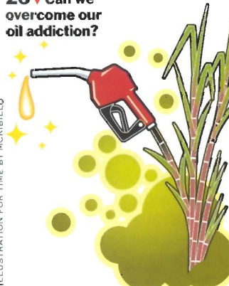
ILLUSTRATION FOR TIME BY MCRIBILLO