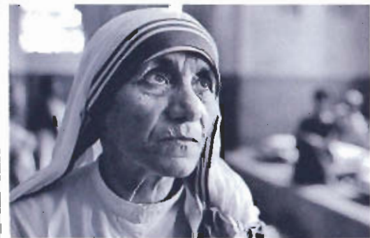
Tormented soul The passion of Mother Teresa, page 26

On the cover: Letter courtesy of Mother Teresa Center. Insets, from left