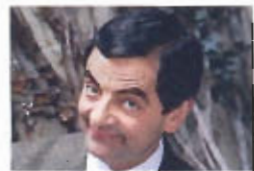
Mr. Bean speaks up Rowan Atkinson, page 4