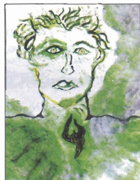
60 NARSAD Art